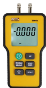
DUAL DIFFERENTIAL DIGITAL MANOMETER