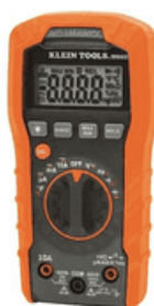
MULTIMETER 600V AUTO RANGING W/ TEMP FUNCT