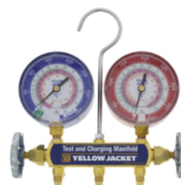
SERIES 41 TEST & CHARGING MANIFOLD