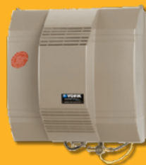
S1-FP7000MT HUMIDIFIER LARGE FAN POWERED (TIB) $249.00