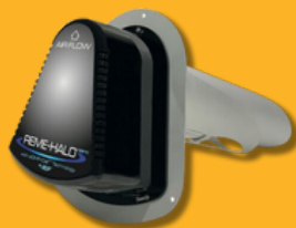
REME ZERO REME HALO 9" 24V $378.68

Photohydroionization® or PHI is a patented Indoor Air Quality (IAQ) technology for installation in various HVAC systems. As used in multiple products, RGF®'s PHI-CELL® creates airborne gaseous hydrogen peroxide for distribution throughout your living and working spaces, reducing viruses, bacteria, mold spores and odors at the source. As Mother Nature's chosen sanitizer, hydrogen peroxide is incredibly effective at reducing these contaminants in your home or office, just as it is outside.