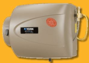
S1-BP5000MT HUMIDIFIER SMALL BYPASS (TIB) $140.00