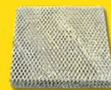
S1-HUPAD35 WATER PANEL #35 $10.27