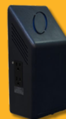
PIP-MAX PLUG-IN PORTABLE W/IONIZATION $290.40