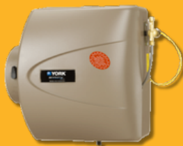
S1-BP6000MT HUMIDIFIER LARGE BYPASS (TIB) $149.00